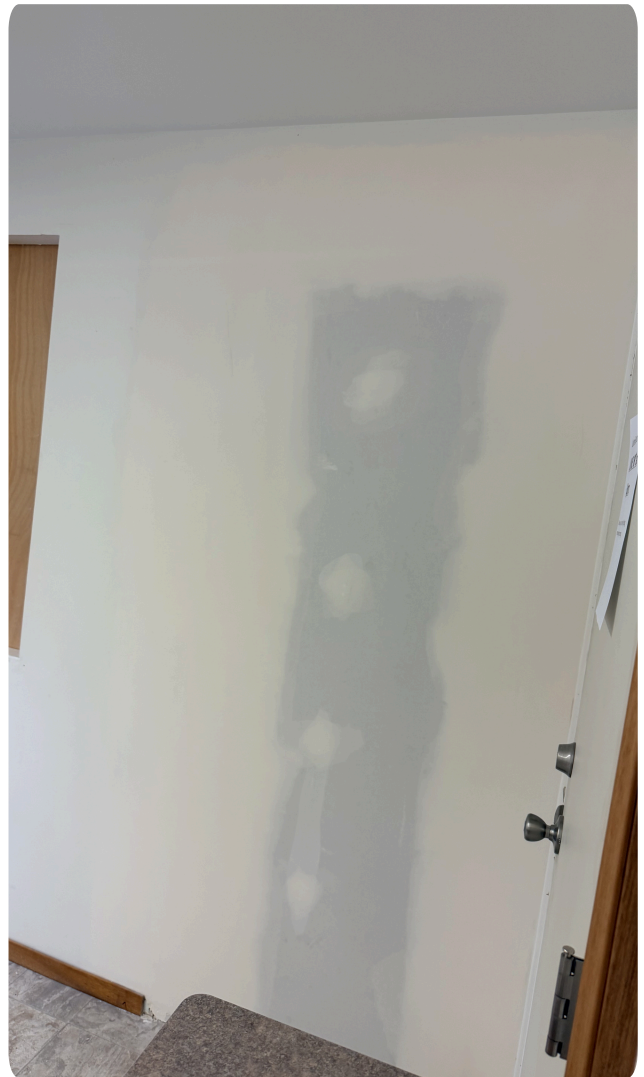
Picture of new wall in CWA main office

In the meantime, if you come to the office to discuss your bill or for any other reason, pay no mind to the dust. We are hoping for this small remodel to be completed by the end of May, if not sooner.